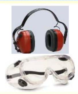
Always wear the proper PPE