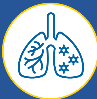
Shortness of Breath