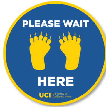
multi-use, floor graphic, door decal or door overlay