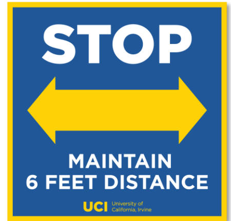
multi-use, floor graphic, door decal or door overlay